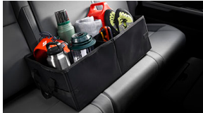
Cargo Tote $ 48 **Parts Only