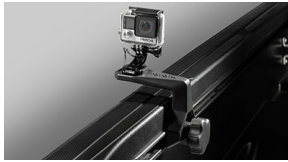
Deck Rail Camera Mount $ 56 *Installed MSRP