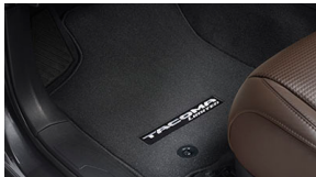
Carpet Floor Mats $ 169 **Parts Only