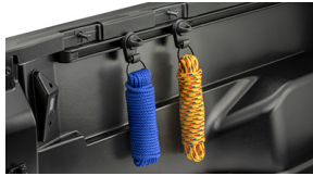
Mini Tie-Downs with Hooks $ 45 *Installed MSRP