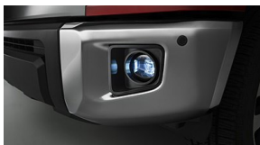
High Performance LED Fog Lights - Chrome $ 139 **Parts Only