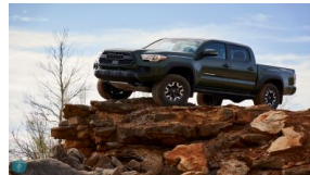
TRD Lift Kit $ 1450 **Parts Only