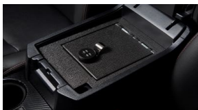
Console Safe $ 359 *Installed MSRP