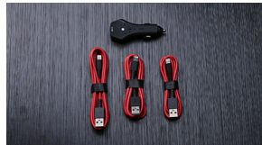
Quick Charge Cable Package $ 70 *Installed MSRP