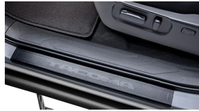
Door Sill Protectors $ 79 *Installed MSRP