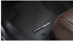
Carpet Floor Mats and Door Sill Protectors $ 248 *Installed MSRP