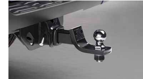
Trailer Ball - 2" $ 20 **Parts Only