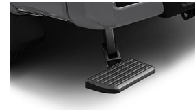
BedStep® $ 300 *Installed MSRP