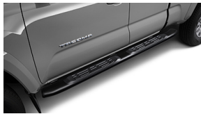
5-In. Oval Tube Steps - Black $ 499 *Installed MSRP