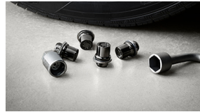
Alloy Wheel Locks- Black PVD $ 54 **Parts Only