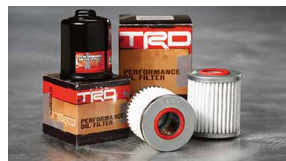
TRD Oil Filter $ 17 **Parts Only