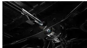
Spare Tire Lock $ 75 *Installed MSRP