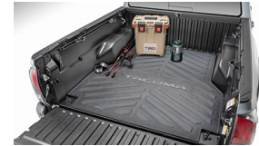
Bed Mat - Long Bed $ 132 *Installed MSRP