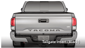
Blackout Package $ 415 *Installed MSRP