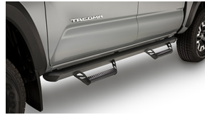
Predator Tube Steps $ 649 *Installed MSRP