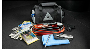
Emergency Assistance Kit $ 59 *Installed MSRP