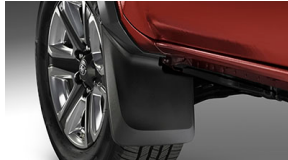
Mudguards $ 129 *Installed MSRP