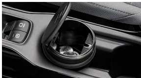
Coin Holder/Ashtray Cup $ 17 **Parts Only