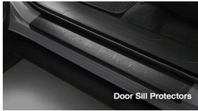
All-Weather Floor Liners and Door Sill Protectors $ 248 *Installed MSRP