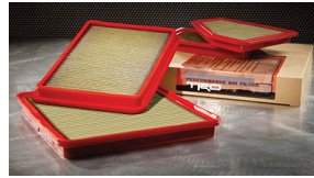
TRD Air Filter $ 90 *Installed MSRP