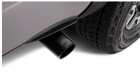
Exhaust Tip (Black Chrome) $ 95 *Installed MSRP