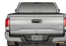
Tailgate Insert (Chrome) $ 99 *Installed MSRP