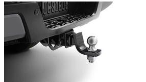
Ball Mount $ 57 **Parts Only