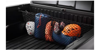
Cargo Net - Exterior $ 49 *Installed MSRP