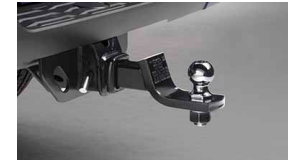
Trailer Ball - 2 5/16" $ 29 **Parts Only