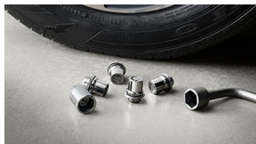
Alloy Wheel Locks - Chrome $ 80 *Installed MSRP