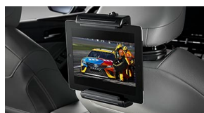
Universal Tablet Holder $ 99 *Installed MSRP