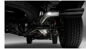
TRD Performance Exhaust System (Black) $ 799 *Installed MSRP