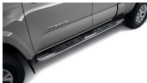
5-In. Oval Tube Steps- Chrome $ 535 *Installed MSRP