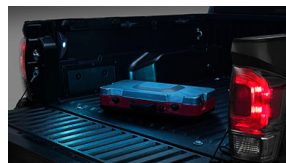
Bed Lighting Kit $ 149 *Installed MSRP