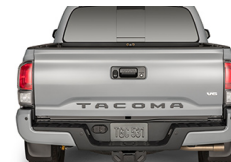
Tailgate Insert (Black) $ 160 *Installed MSRP