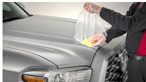
Paint Protection Film - Hood, Fenders, Mirror Backs and Door Cups $ 395 *Installed MSRP