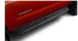
Cast Aluminium Running Boards $ 795 *Installed MSRP