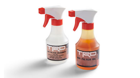
TRD Air Filter Cleaning Kit $ 45 **Parts Only