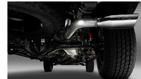
TRD Performance Exhaust System (Chrome) $ 799 *Installed MSRP