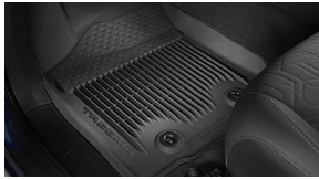
All-Weather Floor Liners $ 169 **Parts Only