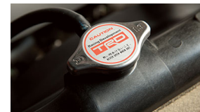
TRD Radiator Cap $ 38 **Parts Only