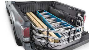
Bed Extender $ 300 *Installed MSRP