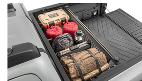
Cargo Divider $ 389 *Installed MSRP