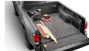
BedRug® Bedliner $ 399 **Parts Only