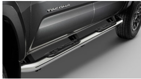
3-In. Round Tube Steps - Chrome for Access Cab $ 277 *Installed MSRP