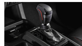
TRD Shift Knob - AT $ 140 *Installed MSRP