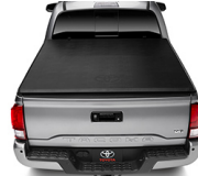
Soft Tonneau Cover $ 769 *Installed MSRP