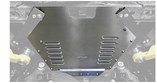
Cat Shield™ by MillerCAT: Associated Accessory Products (AAP), Cat Shield™ by MillerCAT: Associated Accessory Products (AAP)[34], Cat Shield™ by MillerCAT: Associated Accessory Products (AAP), [35] Cat Shield™ by MillerCAT: Associated Accessory Products (AAP), $ 270 ***