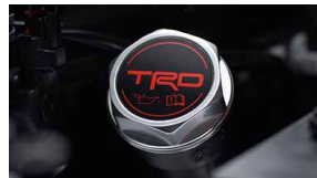
TRD Oil Cap $ 57 **Parts Only