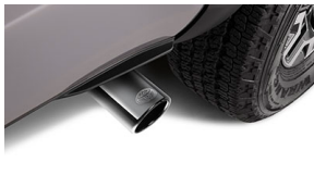
Exhaust Tip (Chrome) $ 90 *Installed MSRP