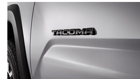
Blackout Emblem Overlay $ 160 *Installed MSRP