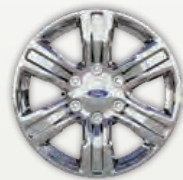
17" Chrome-like PVD Aluminum (included with Chrome Appearance Package)