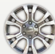
18" Machined Aluminum with Stealth Gray- painted Pockets (standard on Lariat)