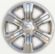
17" Silver-painted Aluminum (standard on XLT, included with XL STX Appearance Package)