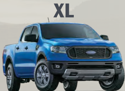
XL WITH FX4 OFF-ROAD AND STX APPEARANCE PACKAGES