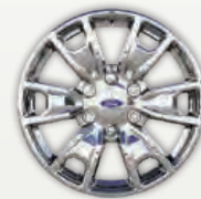
18" Chrome-like PVD Aluminum (included with Chrome Appearance Package on Lariat)