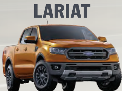
LARIAT WITH FX4 OFF-ROAD AND SPORT APPEARANCE PACKAGES