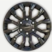
17" Magnetic-painted Aluminum (included with Sport Appearance Package on XLT)