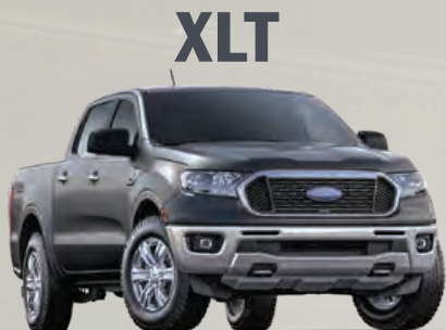
XLT WITH CHROME APPEARANCE AND FX4 OFF-ROAD PACKAGES