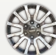
18" Machined Aluminum with Magnetic-painted Pockets (available on XLT and Lariat with Sport Appearance Package)