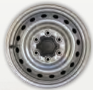
16" Silver-painted Steel (standard on XL)